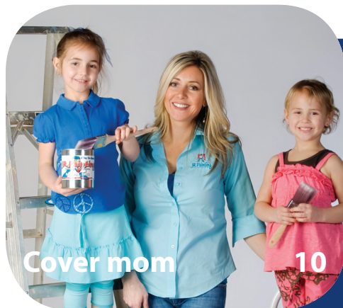
Cover mom 10